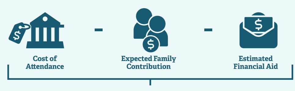
Unmet Financial Need

Eligibility for federal student aid, and for all types of aid for students who receive federal student aid, is determined through a process called "need analysis," which subtracts a student's Expected Family Contribution (EFC) and Estimated Financial Aid (EFA) from their total Cost of Attendance (COA). The resulting amount is their "unmet financial need," which represents the student's eligibility for more financial aid, like emergency aid.